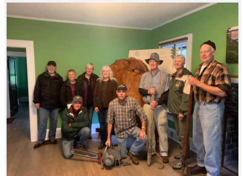
The 'rock house' Ranger Station