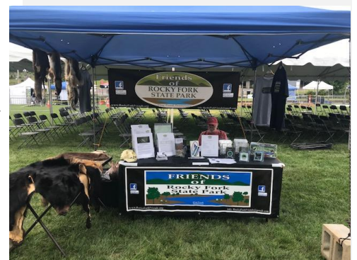
Meet the Mountains Festival

Next Festival: Erwin Apple Festival, Oct 7&8