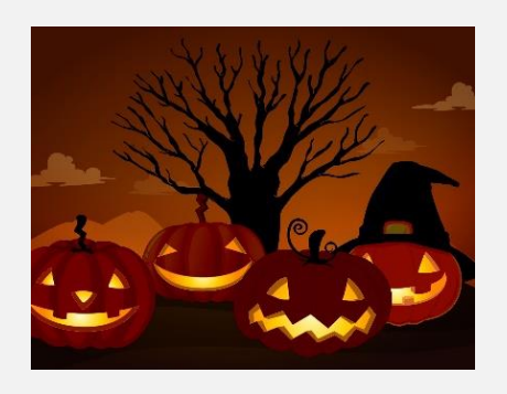
Campfire Ghost Stories, Scavenger Hunt, Treats And Surprises!!

Volunteer Reminder: Logging your hours helps the park! Proof we are invested in RFSP is important for grant funding, justifying needs to TN State Parks and securing donations and other types of support.