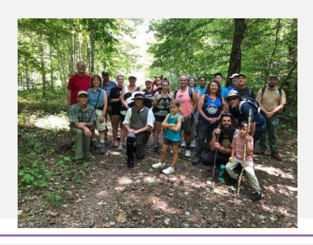
Page 3 of 4